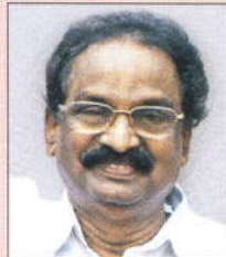
Shri. A. K. BALAN Hon'ble Minister for Welfare of Scheduled Castes Scheduled Tribes and Backward Classes Law, Culture and Parliamentary Affairs