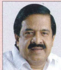
Shri. RAMESH CHENNITHALA Hon'ble Leader of Opposition