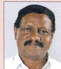
Shri. V. SASI Hon'ble Deputy Speaker Kerala Legislative Assembly