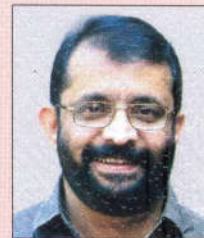
Shri. P. SREERAMAKRISHNAN Hon'ble Speaker, Kerala Legislative Assembly