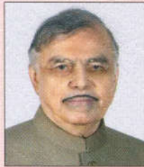
Shri. Justice (Rtd.) P. SATHASIVAM Hon'ble Governor of Kerala