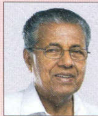
Shri. PINARAYI VIJAYAN Hon'ble Chief Minister of Kerala